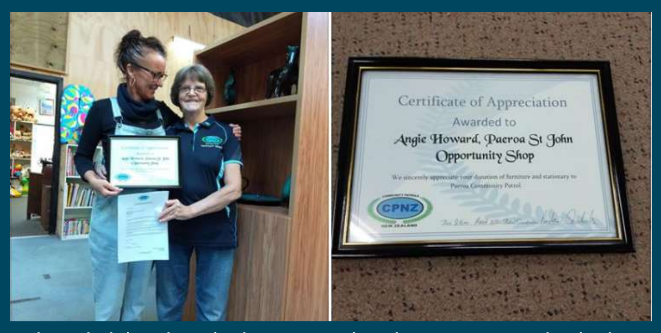
Acknowledging those in the community who support Patrols.....in these uncertain times for many buisnesses, every 'thank you' is important.