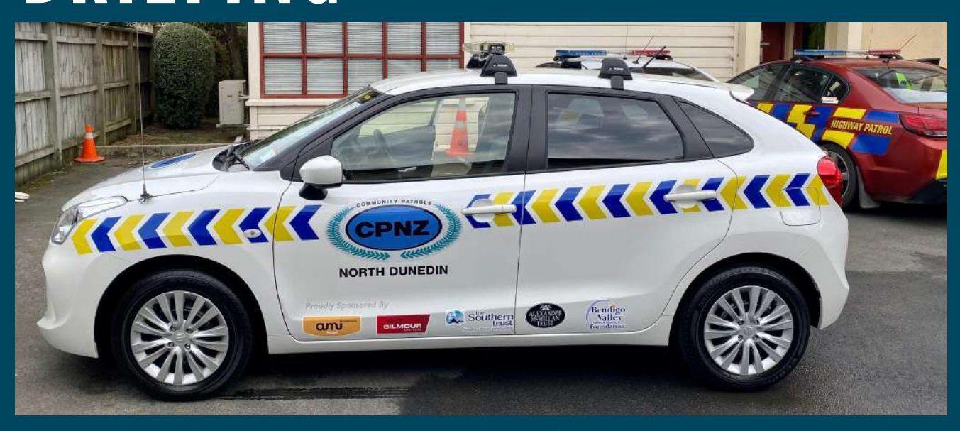
Congratulations Dunedin North Community Patrol on their new vehicle with CPNZ Livery!