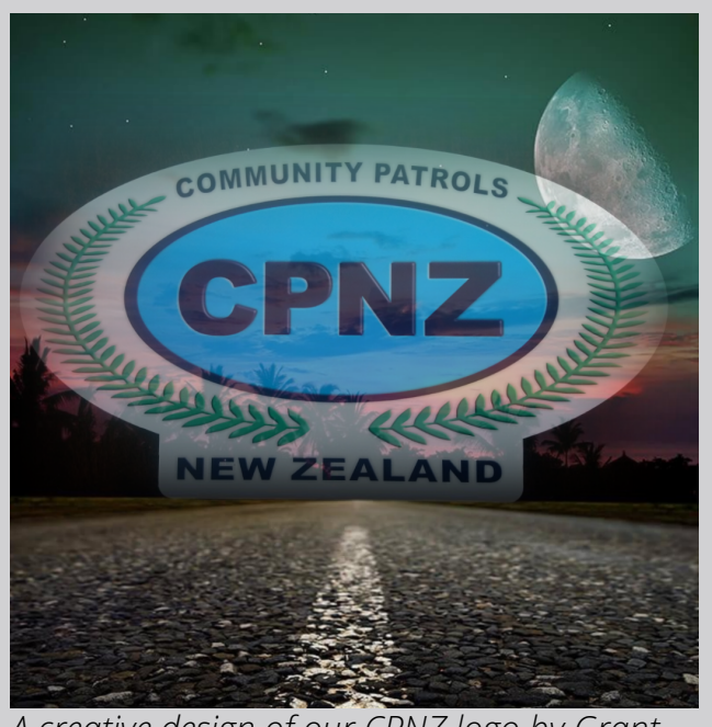
A creative design of our CPNZ logo by Grant Board